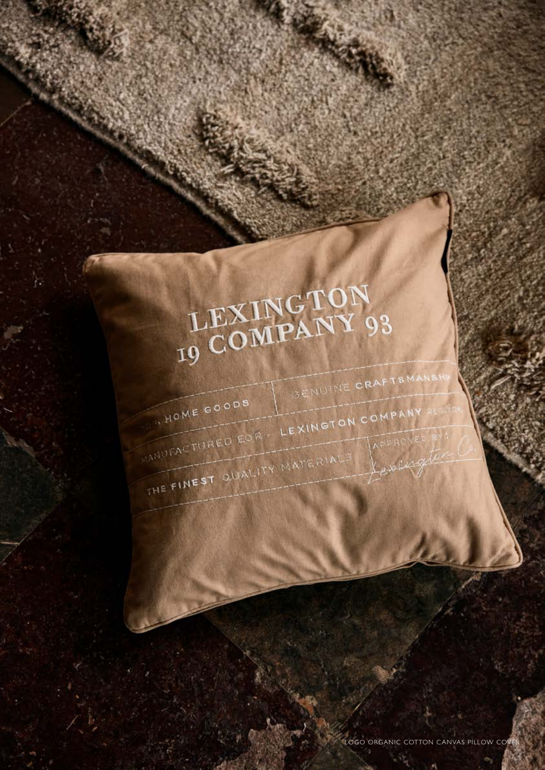
LOGO ORGANIC COTTON CANVAS PILLOW COVER