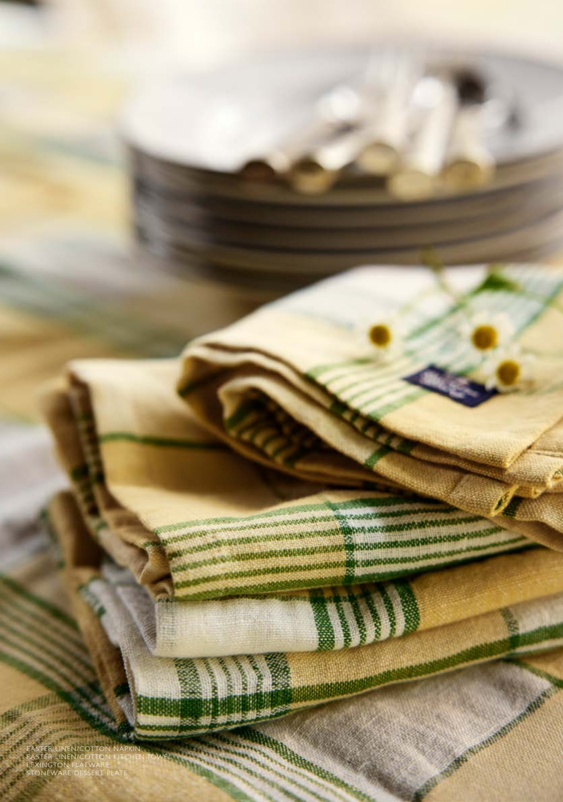
EASTER LINEN/COTTON NAPKIN EASTER LINEN/COTTON KITCHEN TOWEL LEXINGTON FLATWARE STONEWARE DESSERT PLATE