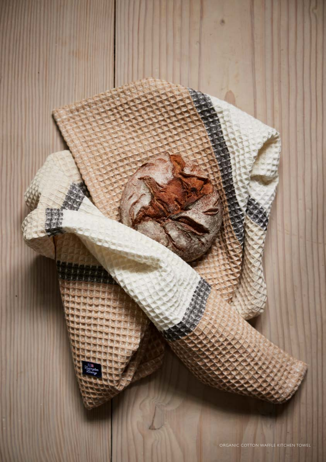
ORGANIC COTTON WAFFLE KITCHEN TOWEL