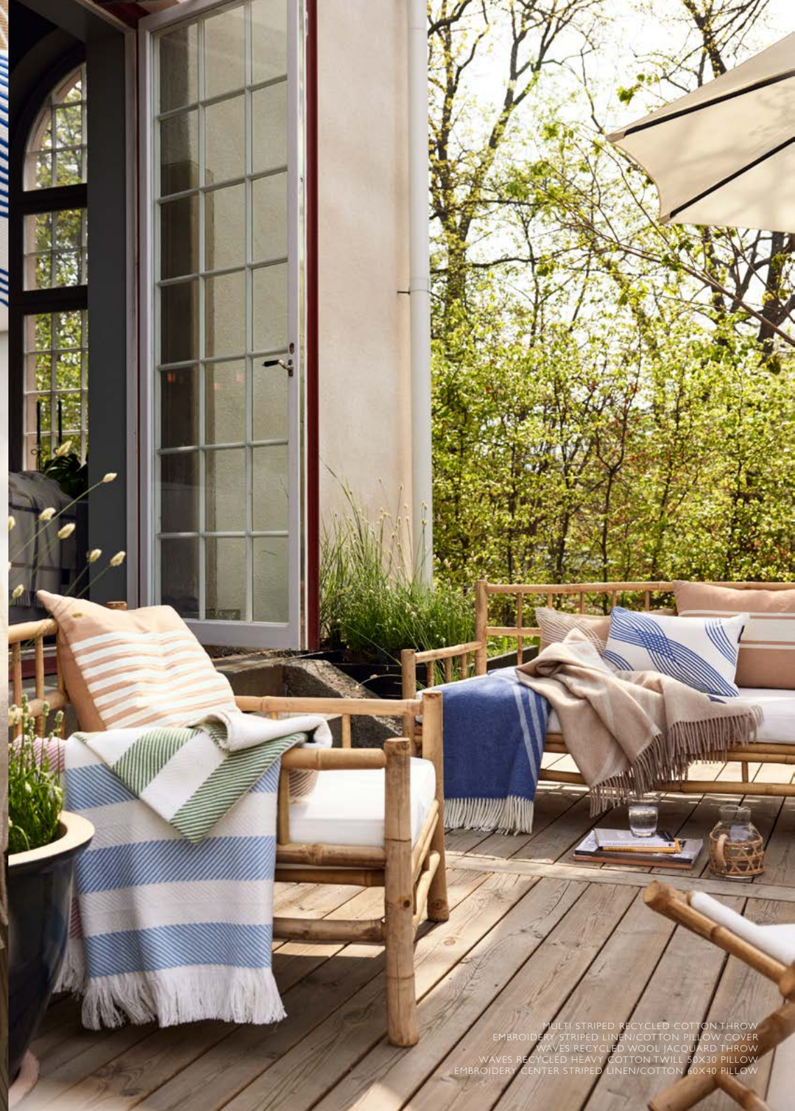
MULTI STRIPED RECYCLED COTTON THROW EMBROIDERY STRIPED LINEN/COTTON PILLOW COVER WAVES RECYCLED WOOL JACQUARD THROW WAVES RECYCLED HEAVY COTTON TWILL 50X30 PILLOW EMBROIDERY CENTER STRIPED LINEN/COTTON 60X40 PILLOW