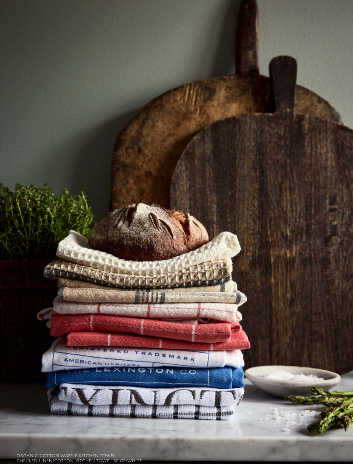
ORGANIC COTTON WAFFLE KITCHEN TOWEL CHECKED LINEN/COTTON KITCHEN TOWEL BEIGE/WHITE CHECKED LINEN/COTTON KITCHEN TOWEL ORGANIC COTTON WAFFLE KITCHEN TOWEL ORGANIC COTTON KITCHEN TOWEL WITH SIDE STRIPES ORGANIC COTTON TERRY KITCHEN TOWEL