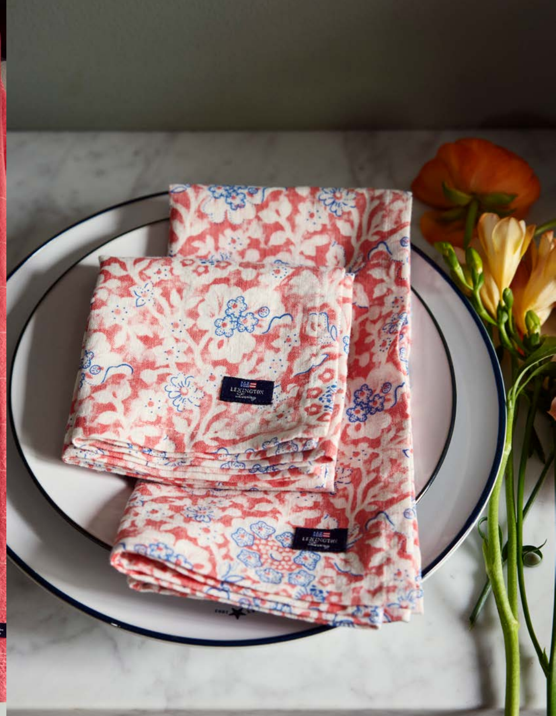
PRINTED FLOWERS RECYCLED COTTON NAPKIN STONEWARE DINNER PLATE STONEWARE DESSERT PLATE