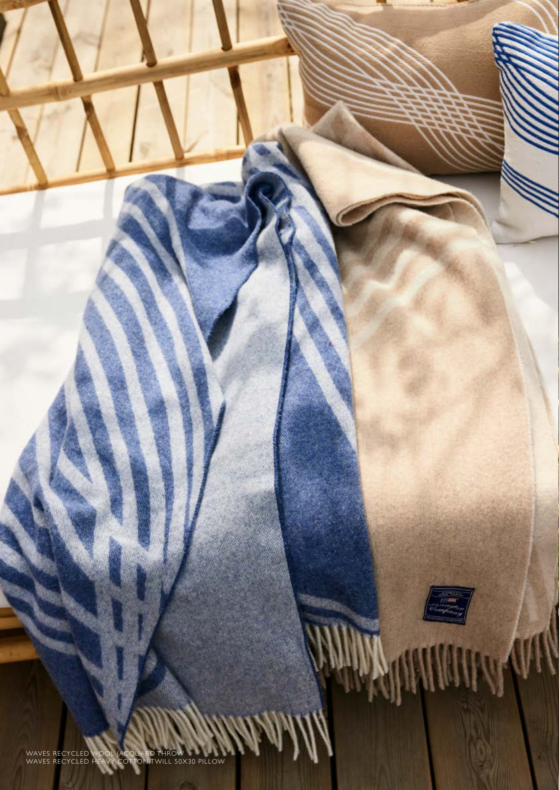
WAVES RECYCLED WOOL JACQUARD THROW WAVES RECYCLED HEAVY COTTON TWILL 50X30 PILLOW