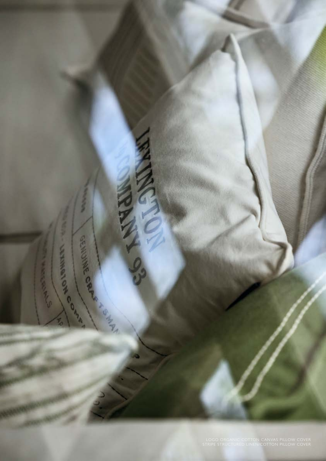
LOGO ORGANIC COTTON CANVAS PILLOW COVER STRIPED STRUCTURED LINEN/COTTON PILLOW COVER