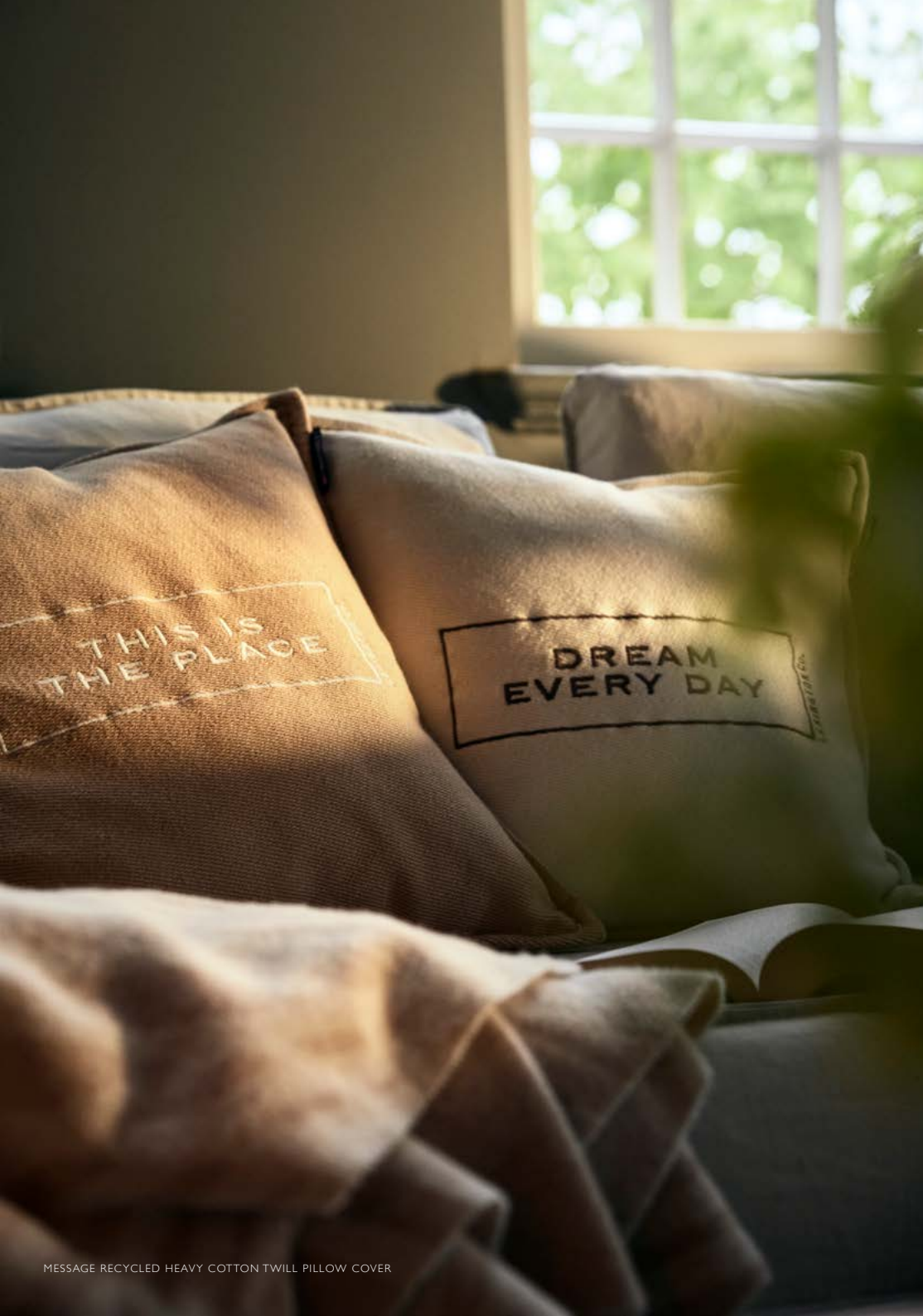
MESSAGE RECYCLED HEAVY COTTON TWILL PILLOW COVER