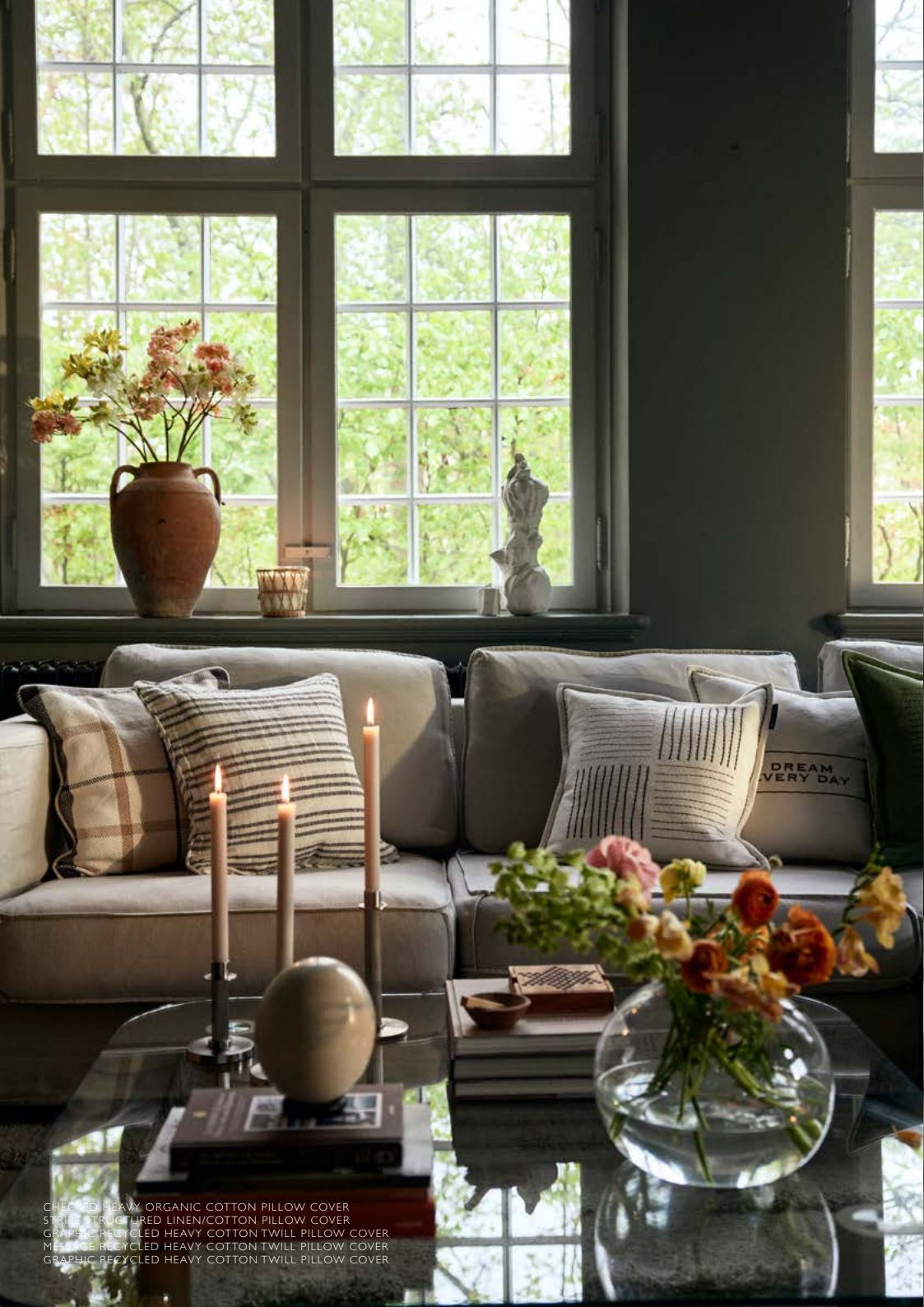
CHECKED HEAVY ORGANIC COTTON PILLOW COVER STRIPED STRUCTURED LINEN/COTTON PILLOW COVER GRAPHIC RECYCLED HEAVY COTTON TWILL PILLOW COVER MESSAGE RECYCLED HEAVY COTTON TWILL PILLOW COVER GRAPHIC RECYCLED HEAVY COTTON TWILL PILLOW COVER