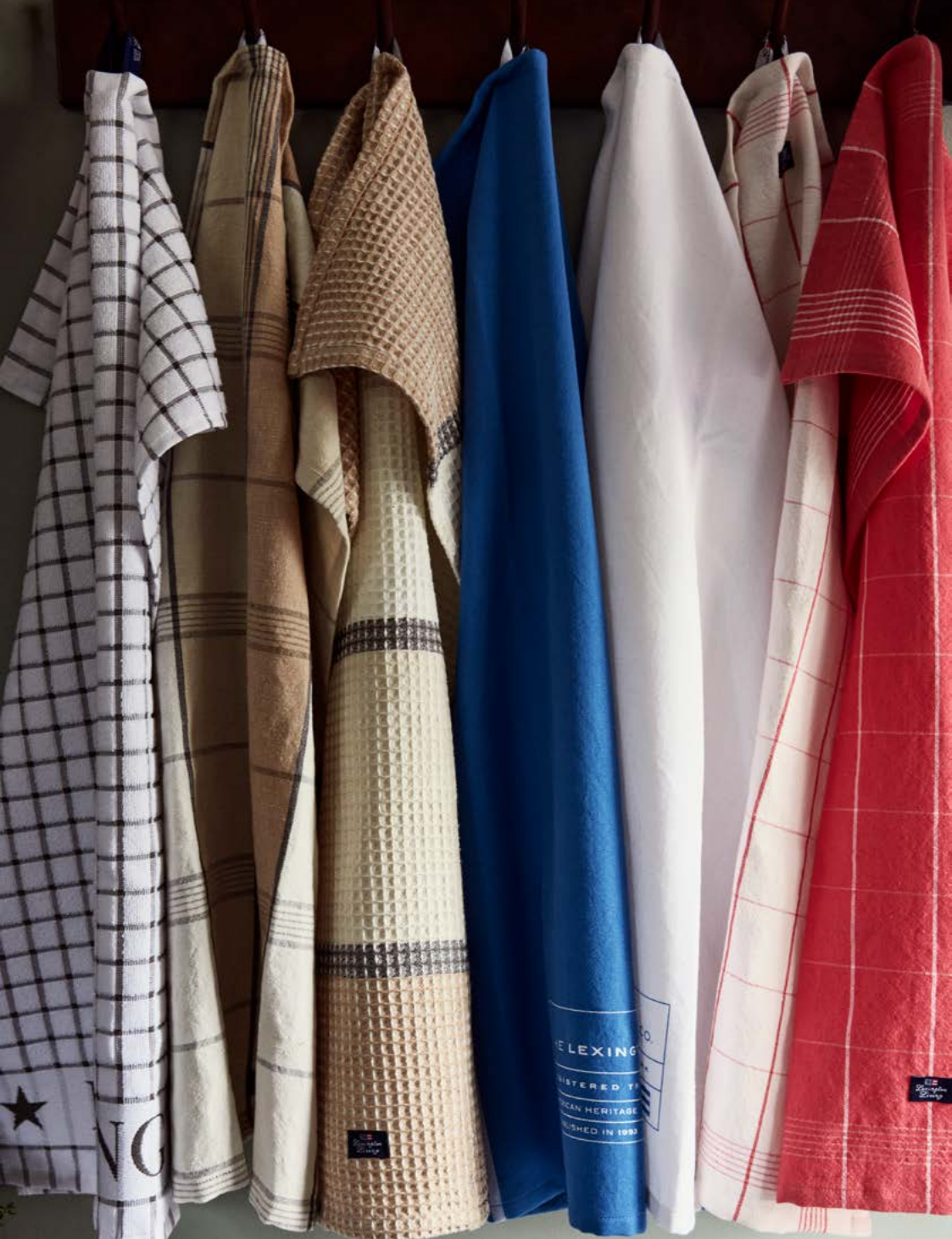
ORGANIC COTTON TERRY KITCHEN TOWEL CHECKED LINEN/COTTON KITCHEN TOWEL BEIGE/WHITE ORGANIC COTTON WAFFLE KITCHEN TOWEL ORGANIC COTTON KITCHEN TOWEL WITH SIDE STRIPES CHECKED LINEN/COTTON KITCHEN TOWEL