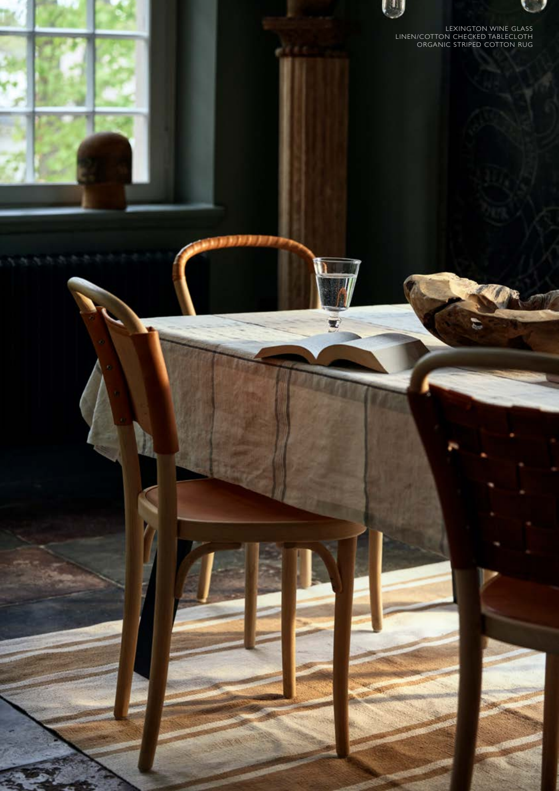
LEXINGTON WINE GLASS LINEN/COTTON CHECKED TABLECLOTH ORGANIC STRIPED COTTON RUG