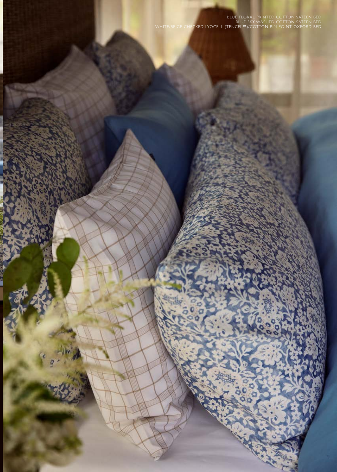
BLUE FLORAL PRINTED COTTON SATEEN BED BLUE SKY WASHED COTTON SATEEN BED WHITE/BEIGE CHECKED LYOCCELL (TENCEL™)/COTTON PIN POINT OXFORD BED