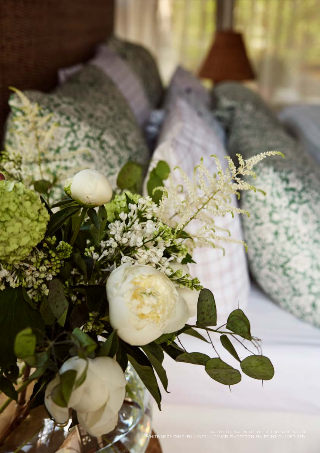
GREEN FLORAL PRINTED COTTON SATOEN BED WHITE/BEIGE CHECKED LYOCCELL (TENCEL™)/COTTON PIN POINT OXFORD BED