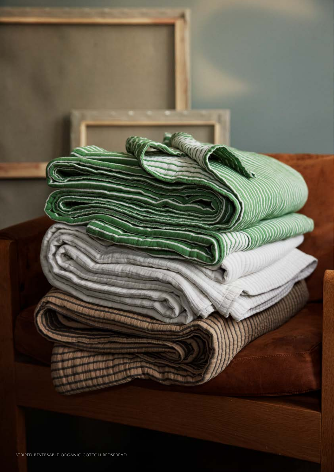
STRIPED REVERSABLE ORGANIC COTTON BEDSPREAD