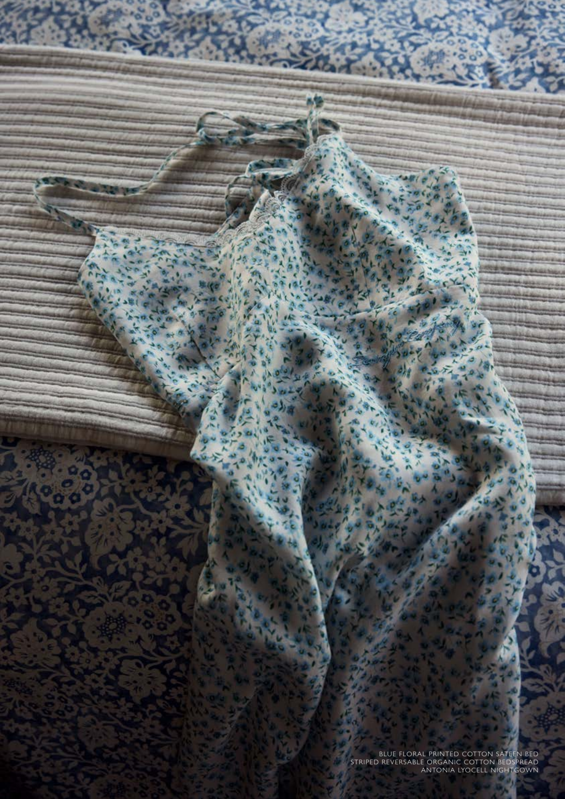
BLUE FLORAL PRINTED COTTON SATEEN BED WAVES RECYCLED WOOL JACQUARD THROW SCENTED CANDLE APPLE BLOSSOM