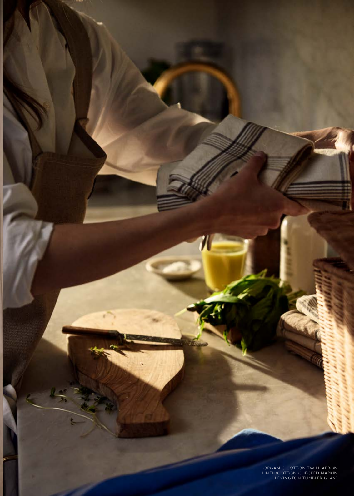
ORGANIC COTTON TWILL APRON LINEN/COTTON CHECKED NAPKIN LEXINGTON TUMBLER GLASS