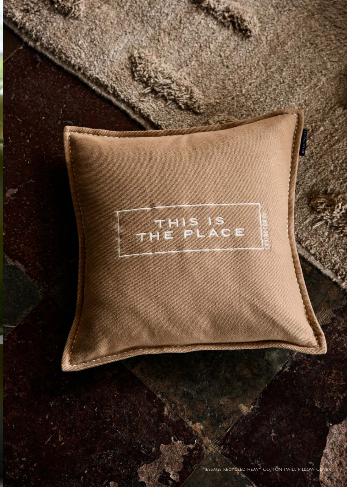
MESSAGE RECYCLED HEAVY COTTON TWILL PILLOW COVER