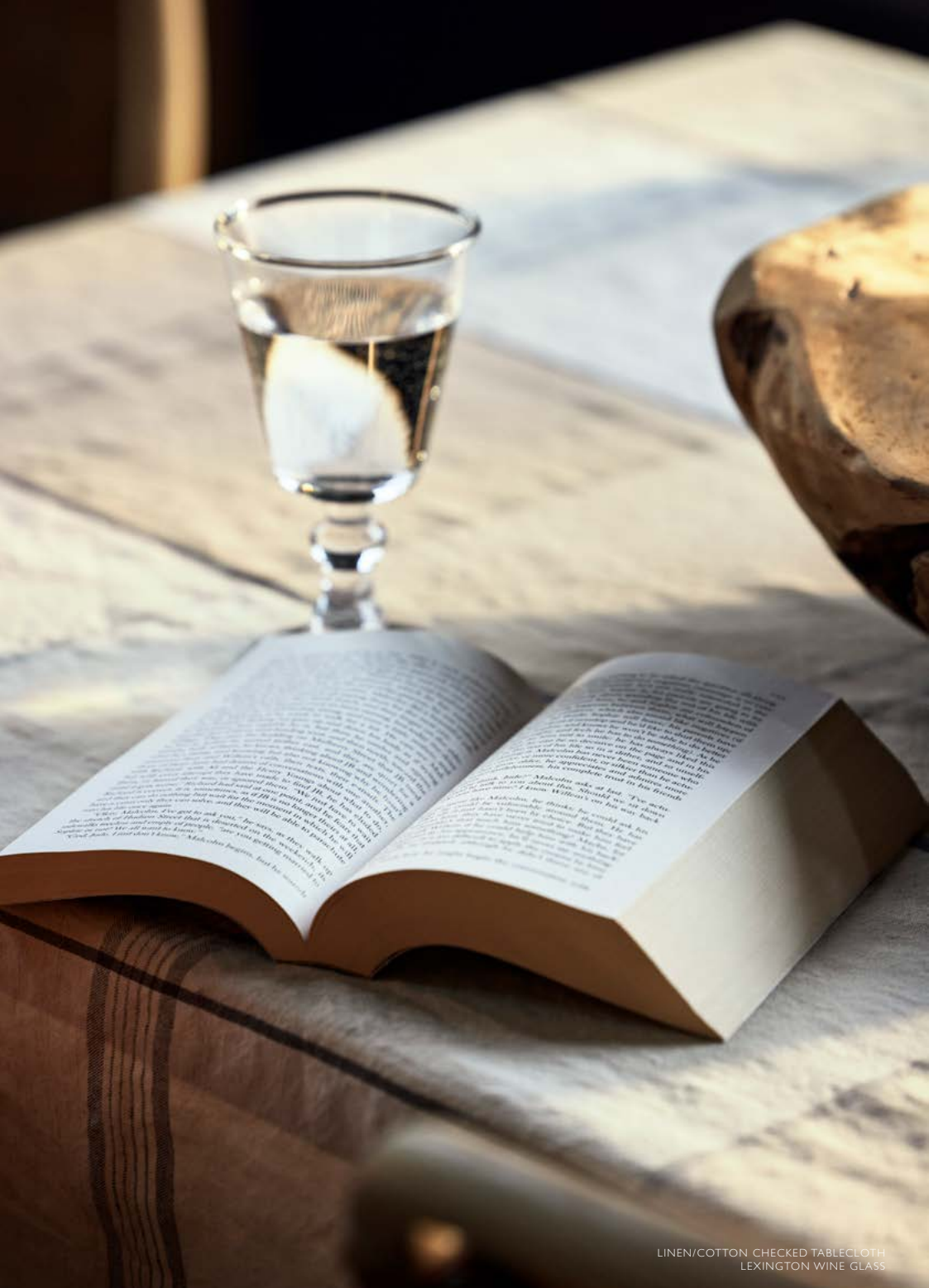
LINEN/COTTON CHECKED TABLECLOTH LEXINGTON WINE GLASS