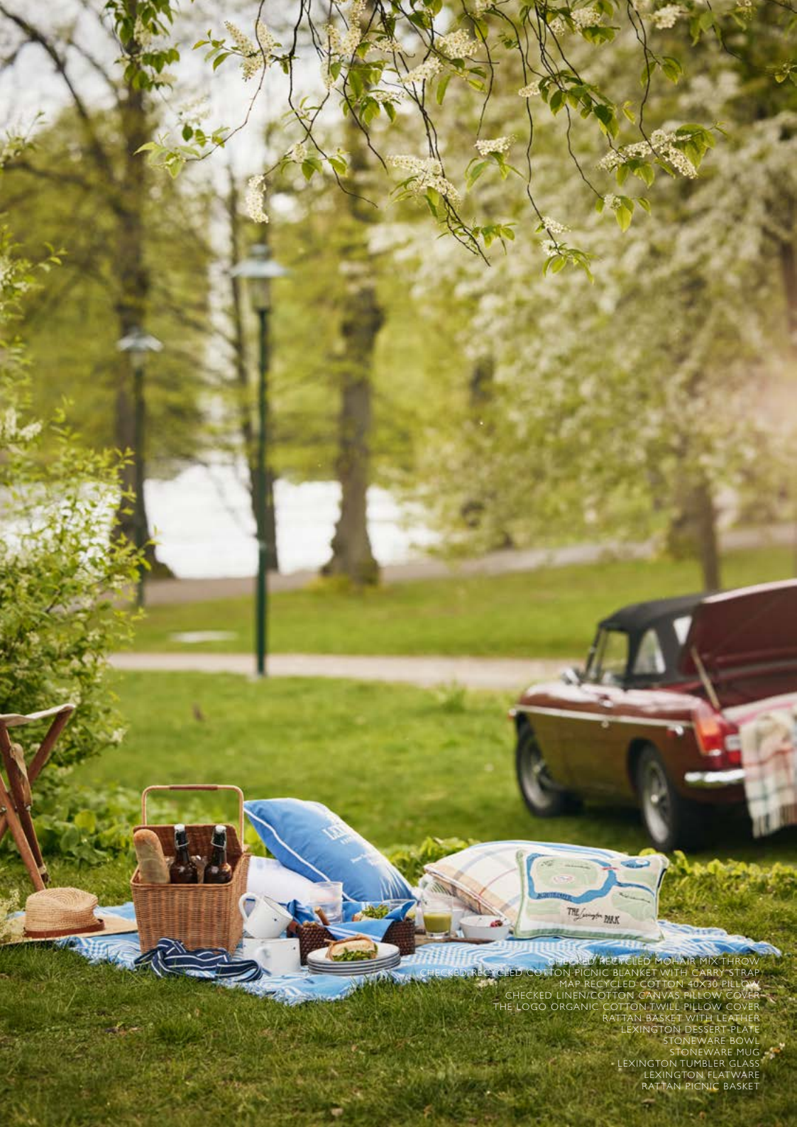
CHECKED RECYCLED MOHAIR MIX THROW CHECKED RECYCLED COTTON PICNIC BLANKET WITH CARRY STRAP MAP RECYCLED COTTON 40X30 PILLOW CHECKED LINEN/COTTON CANVAS PILLOW COVER THE LOGO ORGANIC COTTON TWILL PILLOW COVER RATTAN BASKET WITH LEATHER LEXINGTON DESSERT PLATE STONEWARE BOWL STONEWARE MUG LEXINGTON TUMBLER GLASS LEXINGTON FLATWARE RATTAN PICNIC BASKET