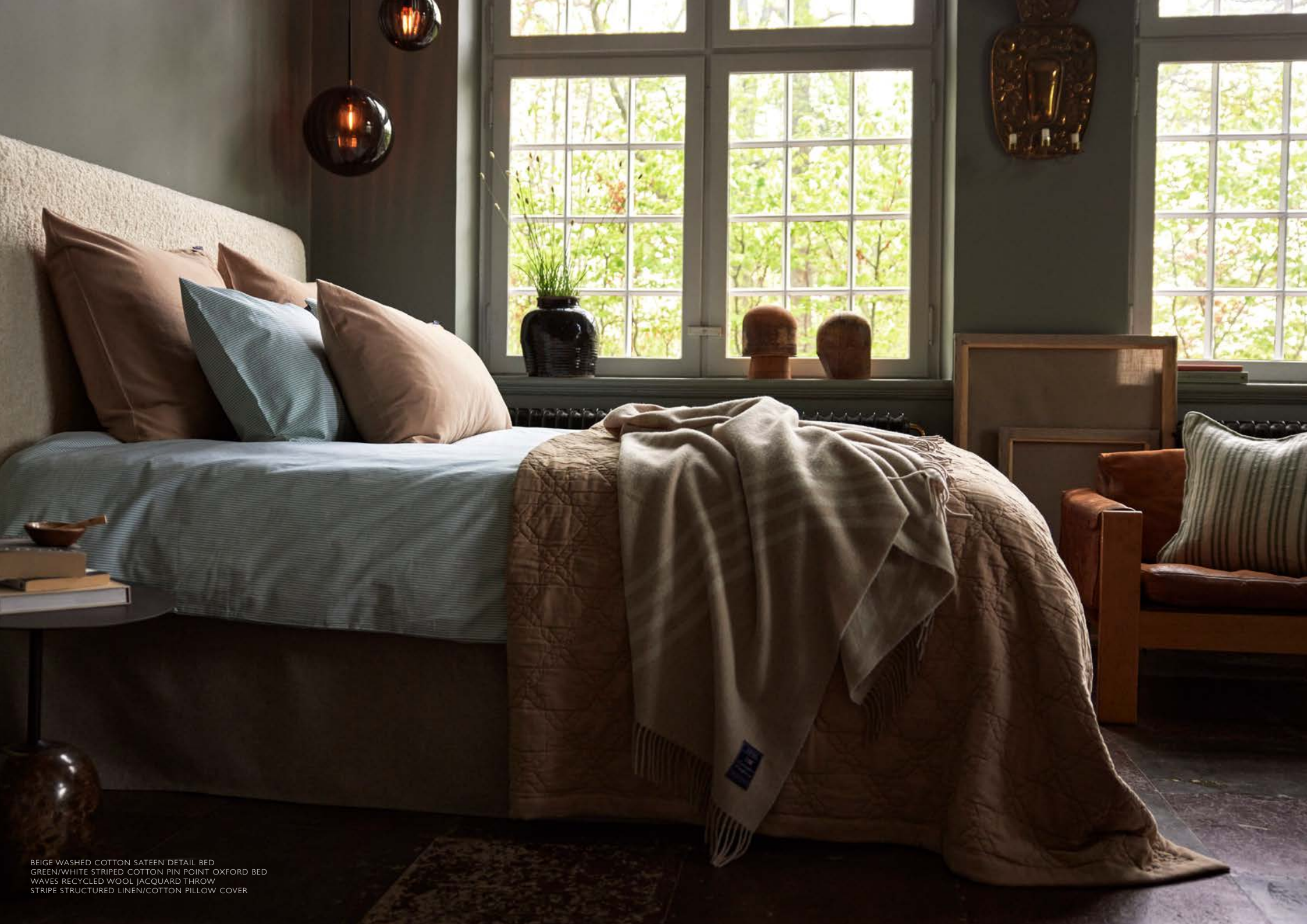
BEIGE WASHED COTTON SATEEN DETAIL BED GREEN/WHITE STRIPED COTTON PIN POINT OXFORD BED WAVES RECYCLED WOOL JACQUARD THROW STRIPE STRUCTURED LINEN/COTTON PILLOW COVER