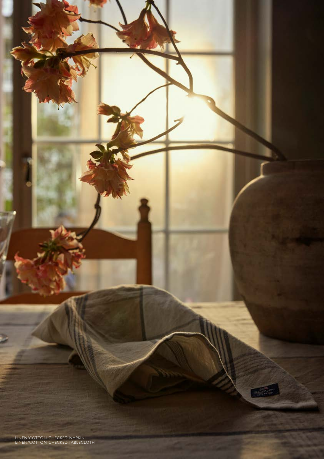
LINEN/COTTON CHECKED NAPKIN LINEN/COTTON CHECKED TABLECLOTH