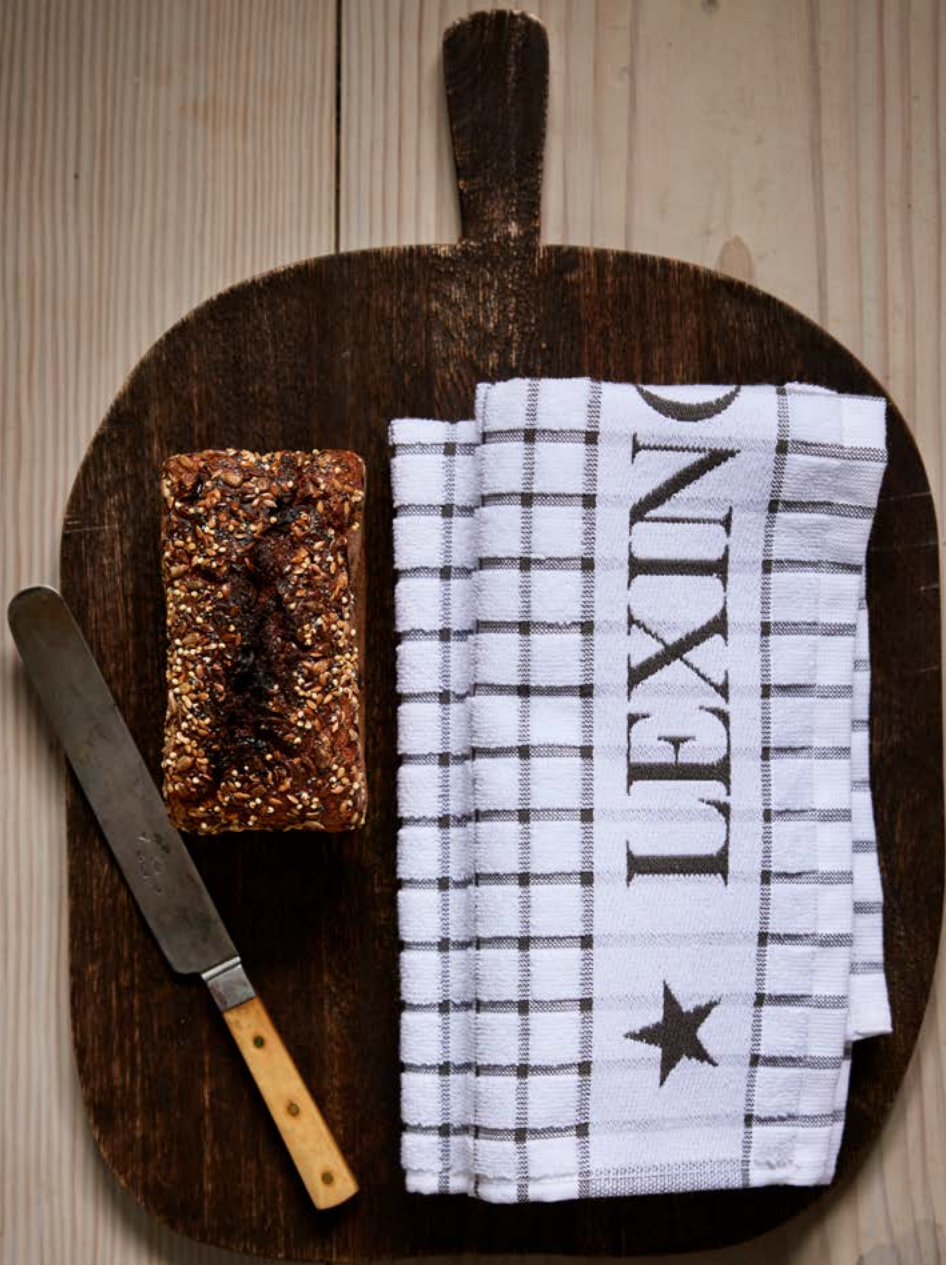
ORGANIC COTTON TERRY KITCHEN TOWEL