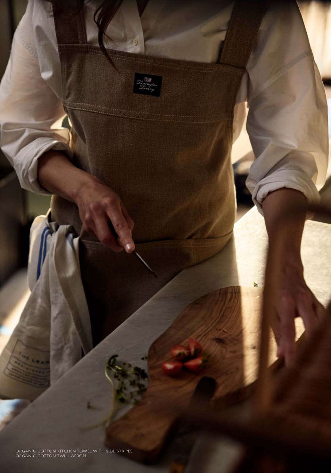
ORGANIC COTTON KITCHEN TOWEL WITH SIDE STRIPES ORGANIC COTTON TWILL APRON