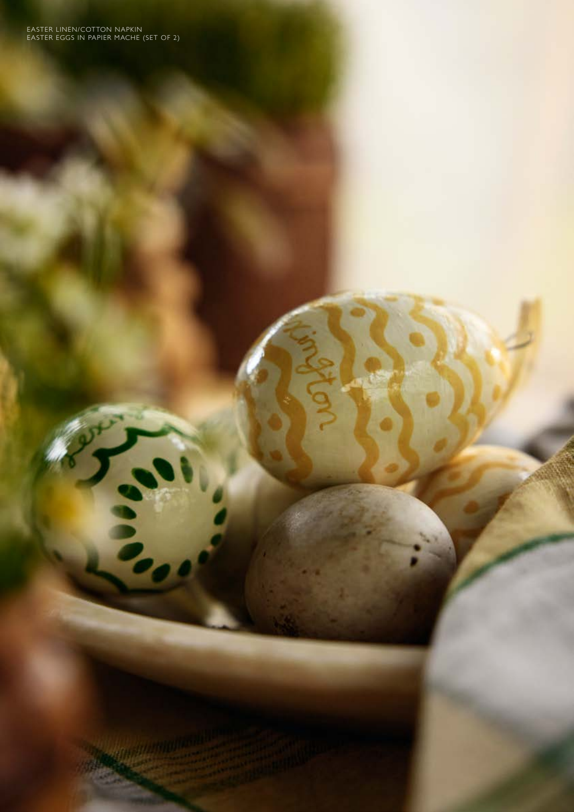
EASTER LINEN/COTTON NAPKIN EASTER EGGS IN PAPIER MACHE (SET OF 2)