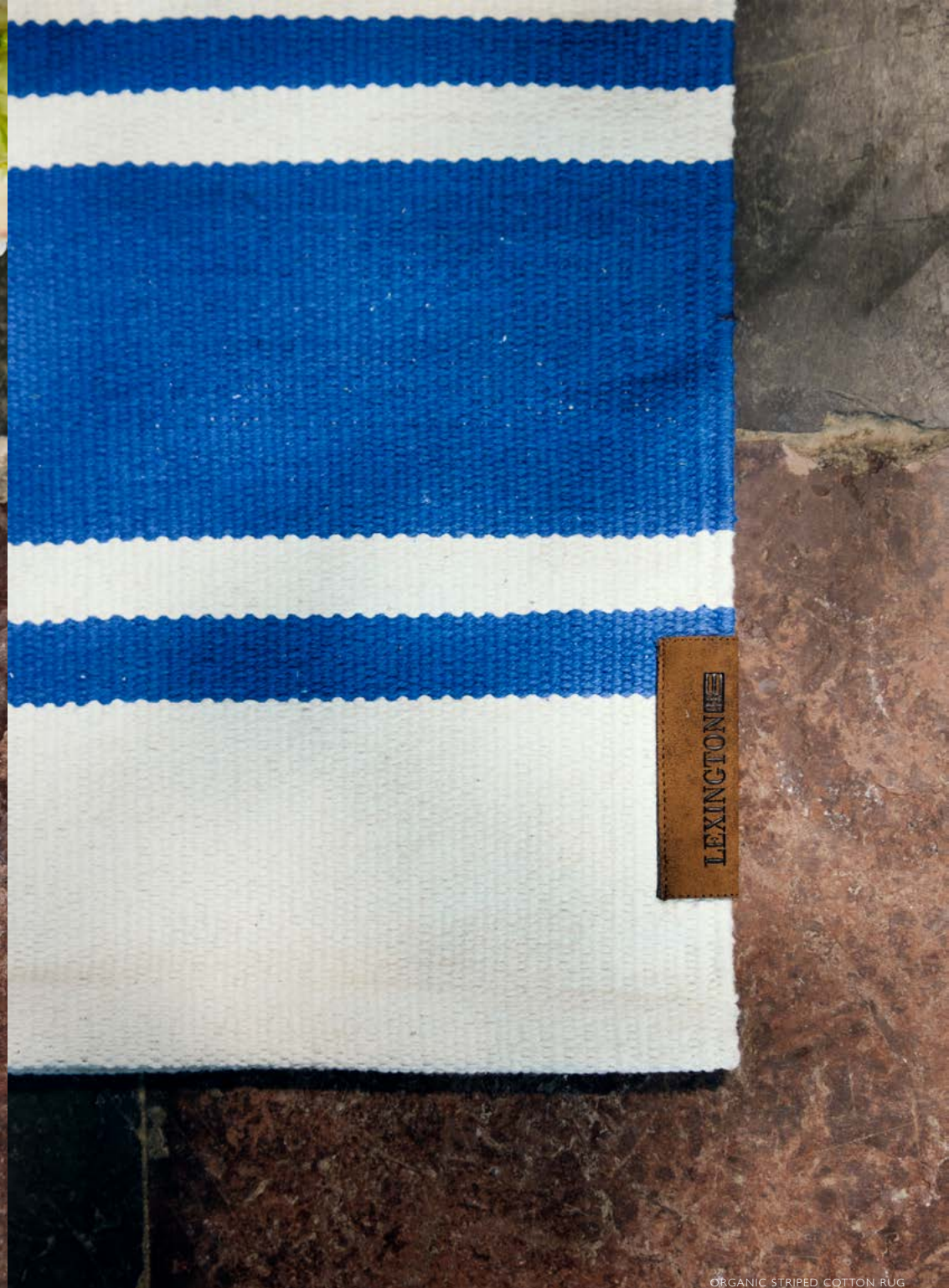
ORGANIC STRIPED COTTON RUG