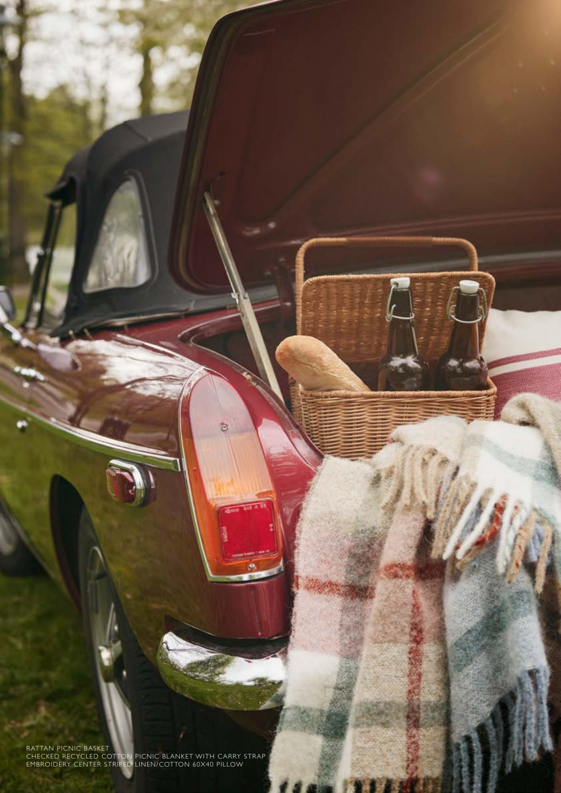
RATTAN PICNIC BASKET CHECKED RECYCLED COTTON PICNIC BLANKET WITH CARRY STRAP EMBROIDERY CENTER STRIPED LINEN/COTTON 60X40 PILLOW