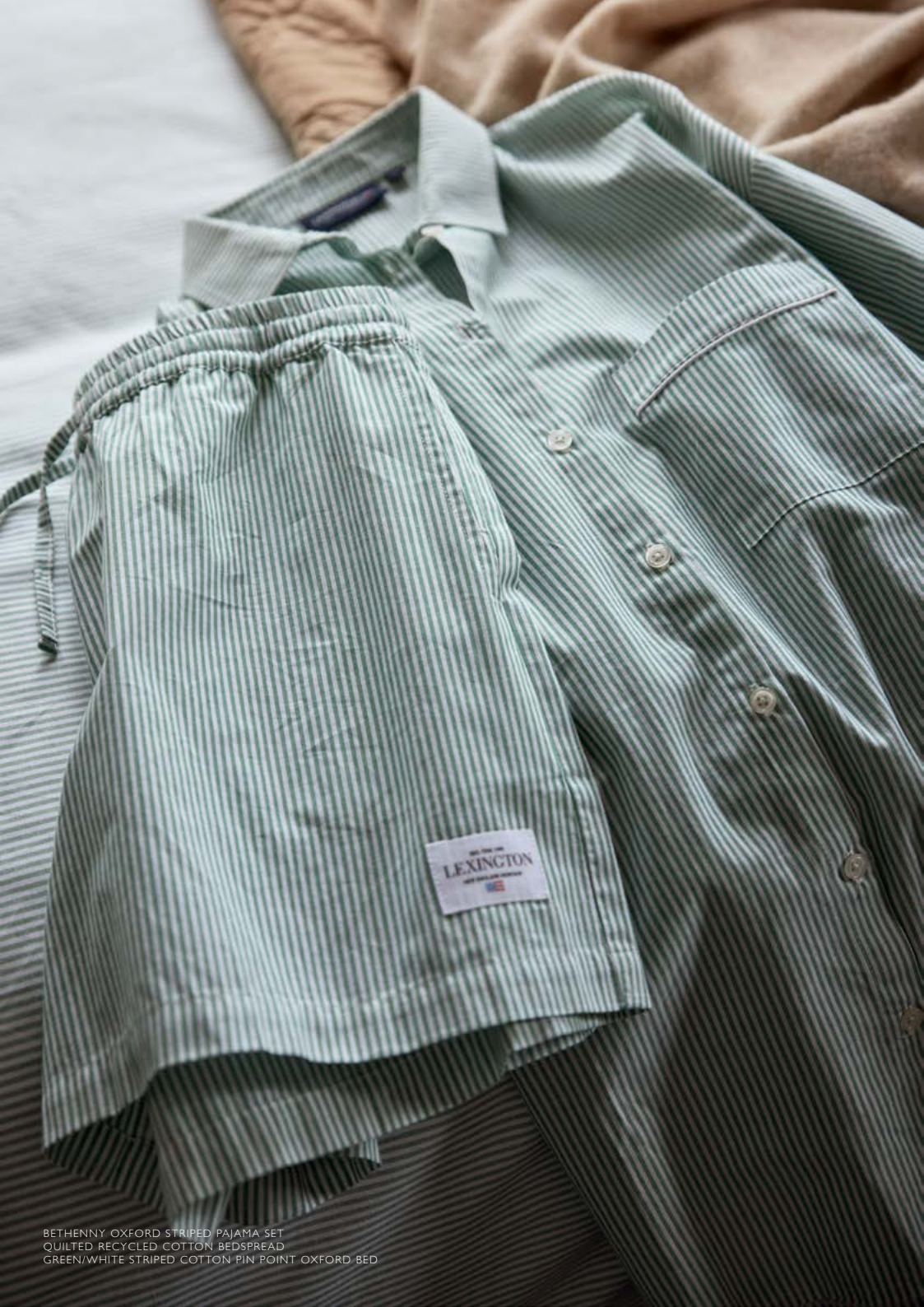
BETHENNY OXFORD STRIPED PAJAMA SET QUILTED RECYCLED COTTON BEDSPREAD GREEN/WHITE STRIPED COTTON PIN POINT OXFORD BED