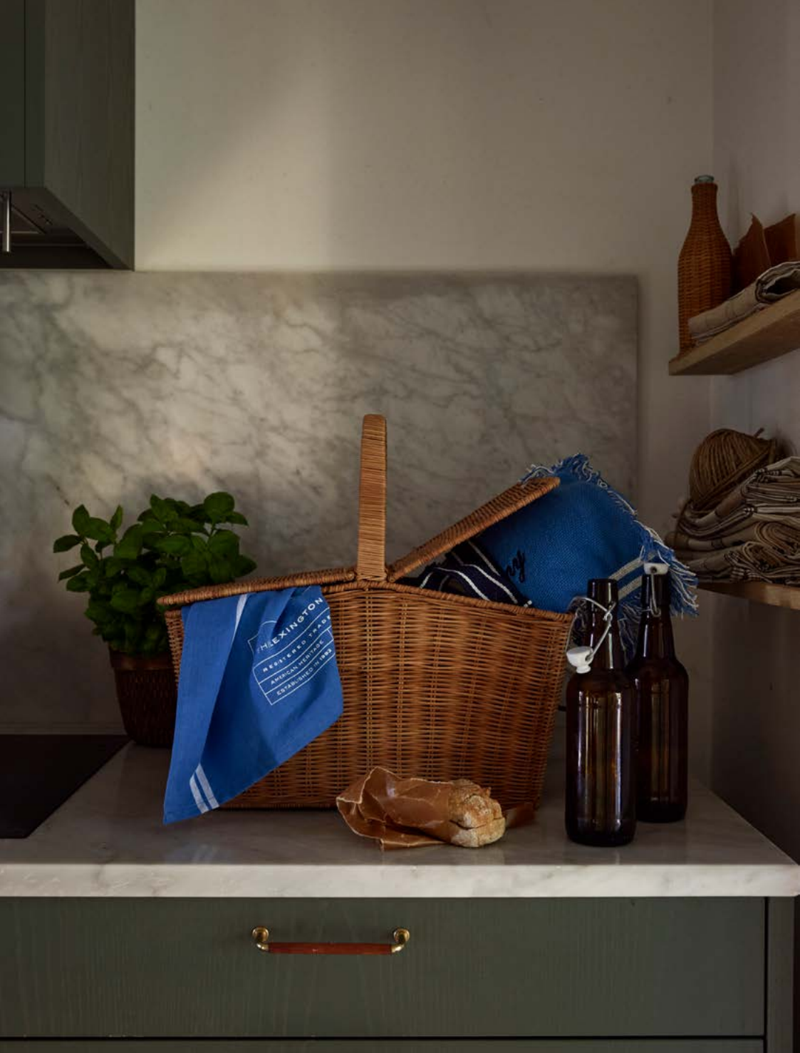
ORGANIC COTTON KITCHEN TOWEL WITH SIDE STRIPES RATTAN PICNIC BASKET CHECKED RECYCLED COTTON PICNIC BLANKET WITH CARRY STRAP LINEN/COTTON CHECKED NAPKIN