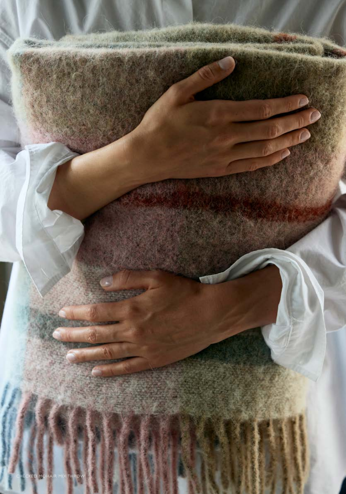
CHECKED MOHAIR MIX THROW

CHECKED RECYCLED WOOL THROW WAVES RECYCLED WOOL JACQUARD THROW CHECKED MOHAIR MIX THROW MULTI STRIPED RECYCLED COTTON THROW