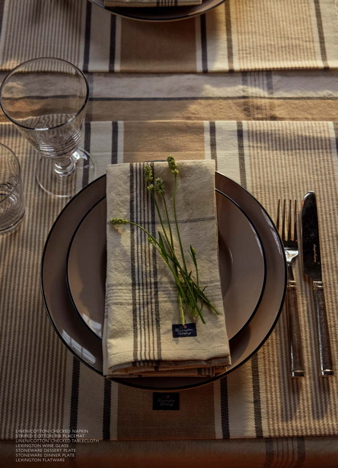
LINEN/COTTON CHECKED NAPKIN STRIPED COTTON RIB PLACEMAT LINEN/COTTON CHECKED TABLECLOTH LEXINGTON WINE GLASS STONEWARE DESSERT PLATE STONEWARE DINNER PLATE LEXINGTON FLATWARE