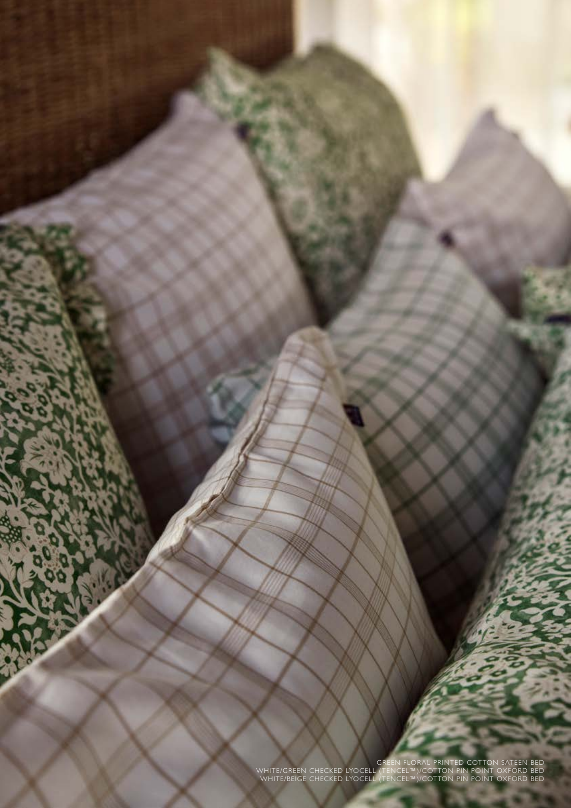
GREEN FLORAL PRINTED COTTON SATEEN BED WHITE/GREEN CHECKED LYOCCELL (TENCEL™)/COTTON PIN POINT OXFORD BED WHITE/BEIGE CHECKED LYOCCELL (TENCEL™)/COTTON PIN POINT OXFORD BED