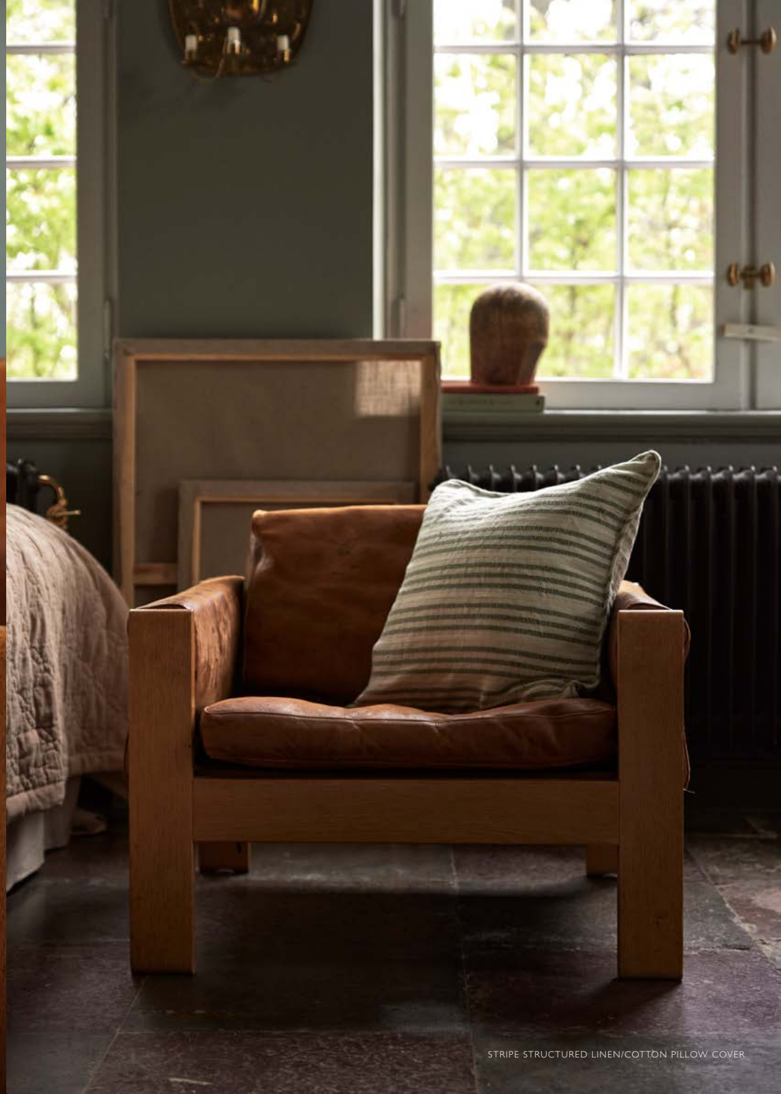
STRIPED STRUCTURED LINEN/COTTON PILLOW COVER