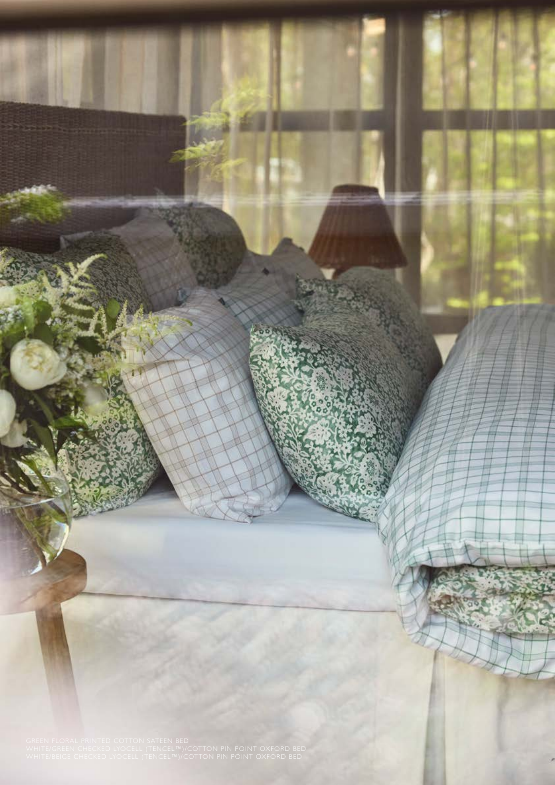
GREEN FLORAL PRINTED COTTON SATEEN BED WHITE/GREEN CHECKED LYOCCELL (TENCEL™)/COTTON PIN POINT OXFORD BED WHITE/BEIGE CHECKED LYOCCELL (TENCEL™)/COTTON PIN POINT OXFORD BED