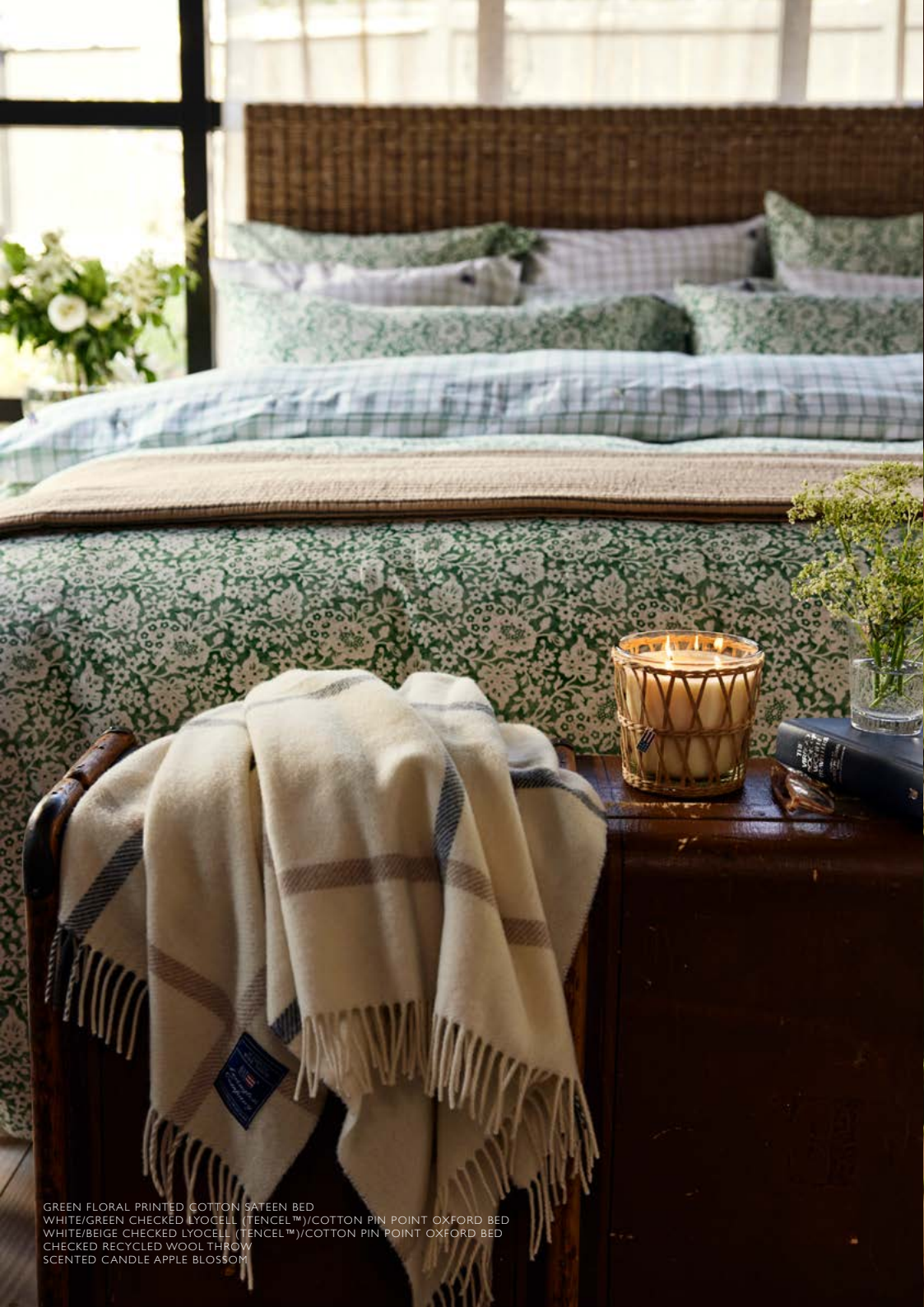
GREEN FLORAL PRINTED COTTON SATOEN BED WHITE/GREEN CHECKED LYOCCELL (TENCEL™)/COTTON PIN POINT OXFORD BED WHITE/BEIGE CHECKED LYOCCELL (TENCEL™)/COTTON PIN POINT OXFORD BED CHECKED RECYCLED WOOL THROW SCENTED CANDLE APPLE BLOSSOM