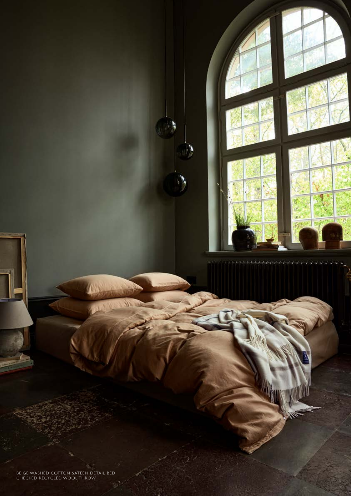
BEIGE WASHED COTTON SATEEN DETAIL BED CHECKED RECYCLED WOOL THROW