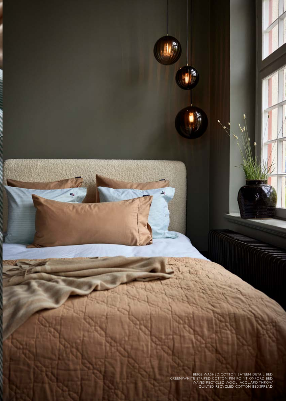
BEIGE WASHED COTTON SATEEN DETAIL BED GREEN/WHITE STRIPED COTTON PIN POINT OXFORD BED WAVES RECYCLED WOOL JACQUARD THROW QUILTED RECYCLED COTTON BEDSPREAD