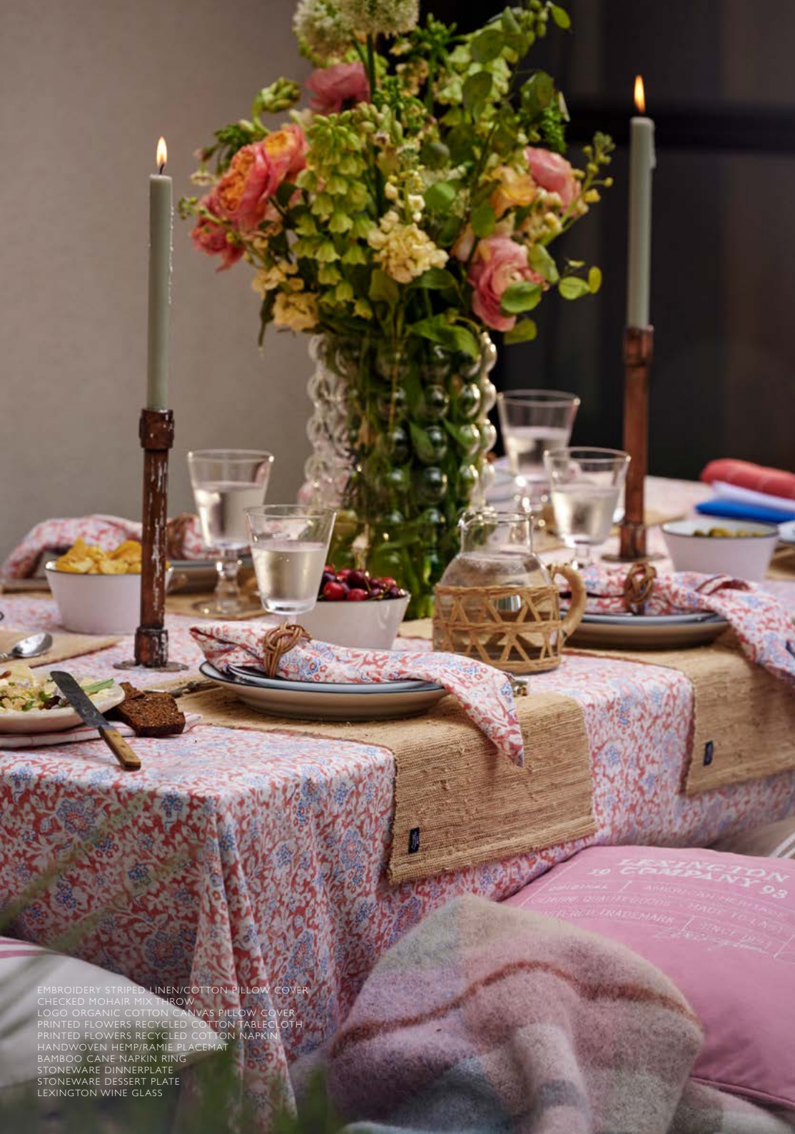
EMBROIDERY STRIPED LINEN/COTTON PILLOW COVER CHECKED MOHAIR MIX THROW LOGO ORGANIC COTTON CANVAS PILLOW COVER PRINTED FLOWERS RECYCLED COTTON TABLECLOTH PRINTED FLOWERS RECYCLED COTTON NAPKIN HANDWOVEN HEMP/RAMIE PLACEMAT BAMBOO CANE NAPKIN RING STONEWARE DINNERPLATE STONEWARE DESSERT PLATE LEXINGTON WINE GLASS