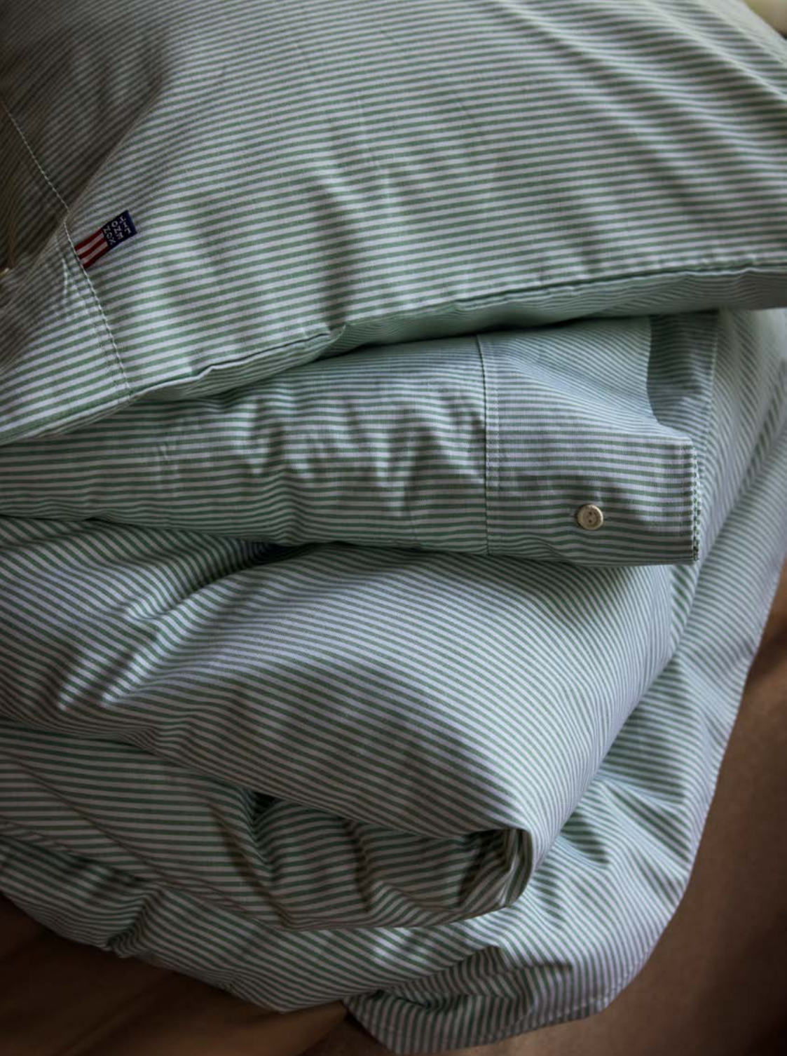
GREEN/WHITE STRIPED COTTON PIN POINT OXFORD BED