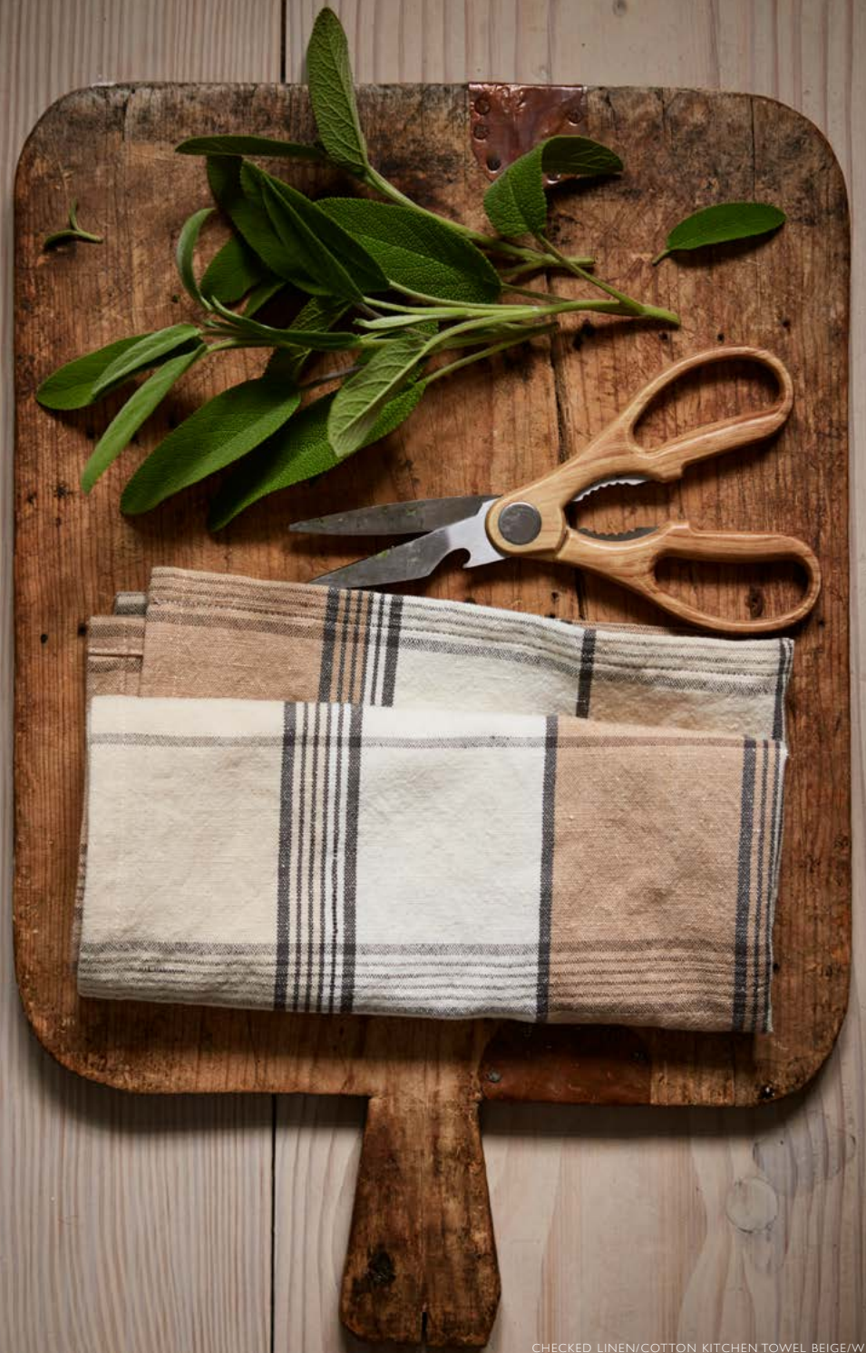
CHECKED LINEN/COTTON KITCHEN TOWEL BEIGE/WHITE