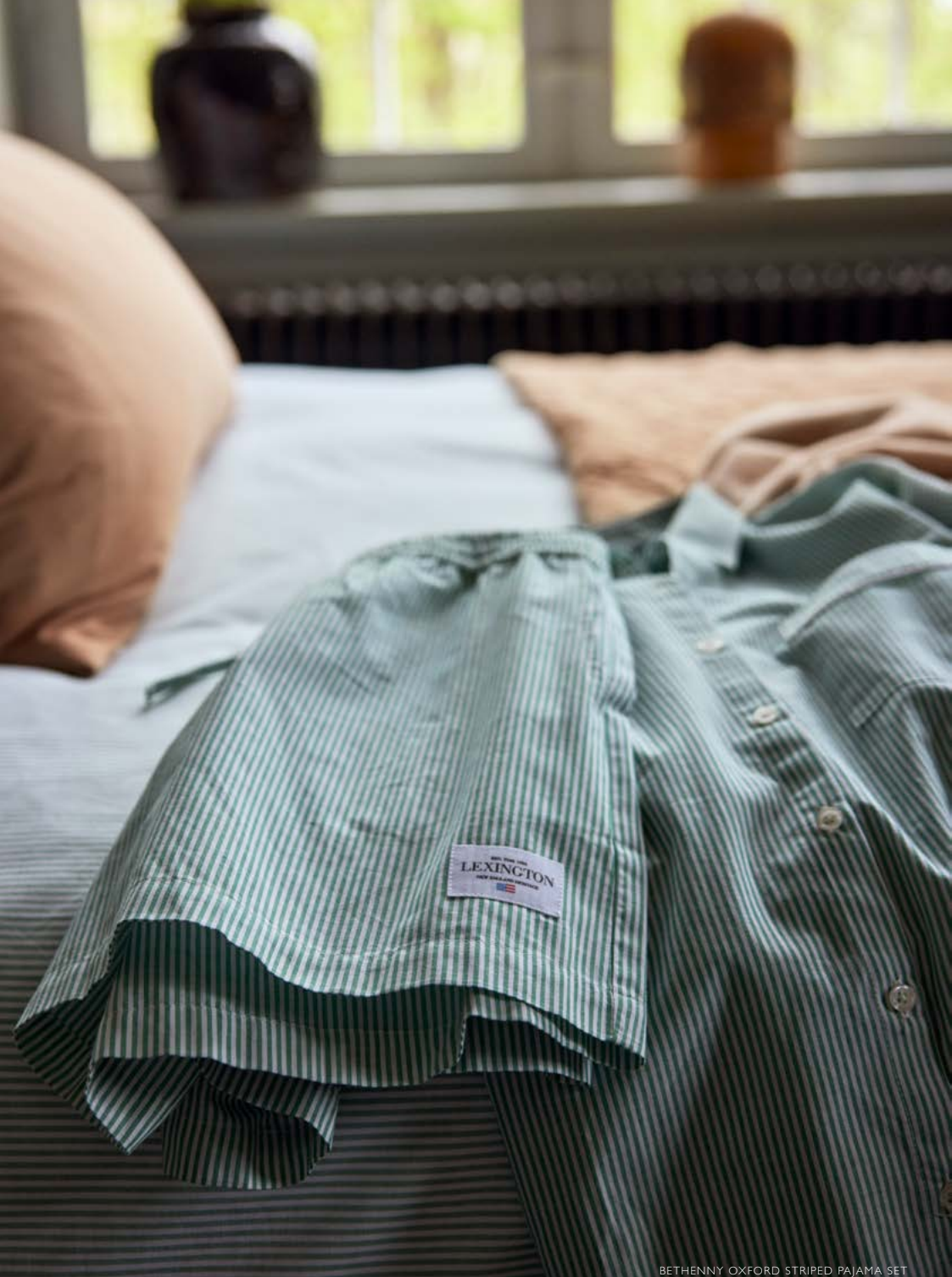
BETHENNY OXFORD STRIPED PAJAMA SET BEIGE WASHED COTTON SATEEN DETAIL BED GREEN/WHITE STRIPED COTTON PIN POINT OXFORD BED