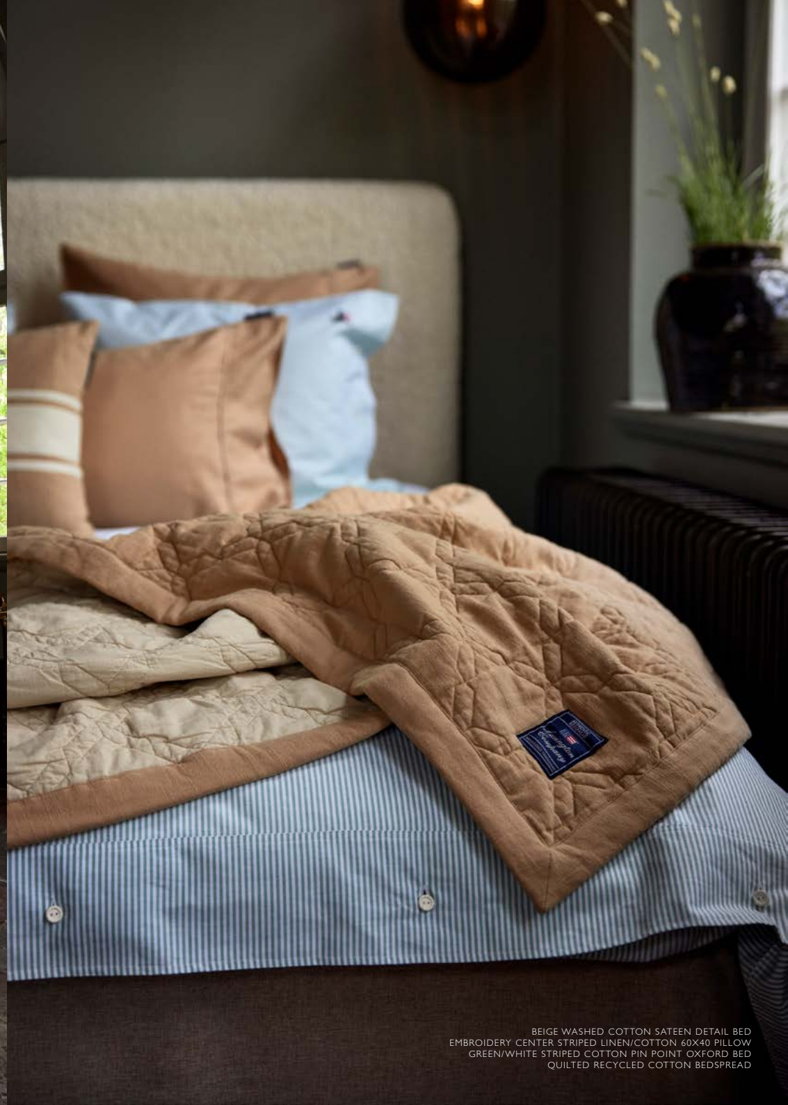
BEIGE WASHED COTTON SATEEN DETAIL BED EMBROIDERY CENTER STRIPED LINEN/COTTON 60X40 PILLOW GREEN/WHITE STRIPED COTTON PIN POINT OXFORD BED QUILTED RECYCLED COTTON BEDSPREAD