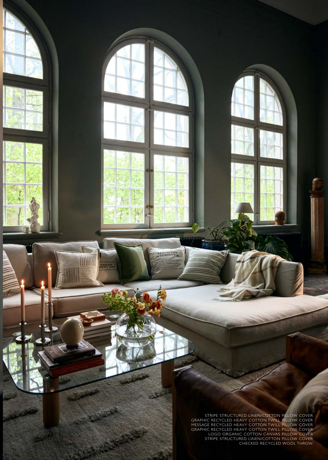
STRIPE STRUCTURED LINEN/COTTON PILLOW COVER GRAPHIC RECYCLED HEAVY COTTON TWILL PILLOW COVER MESSAGE RECYCLED HEAVY COTTON TWILL PILLOW COVER GRAPHIC RECYCLED HEAVY COTTON TWILL PILLOW COVER LOGO ORGANIC COTTON CANVAS PILLOW COVER STRIPE STRUCTURED LINEN/COTTON PILLOW COVER CHECKED RECYCLED WOOL THROW