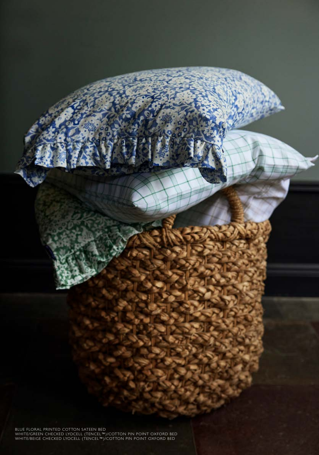
BLUE FLORAL PRINTED COTTON SATEEN BED WHITE/GREEN CHECKED LYOCELL (TENCEL™)/COTTON PIN POINT OXFORD BED WHITE/BEIGE CHECKED LYOCELL (TENCEL™)/COTTON PIN POINT OXFORD BED