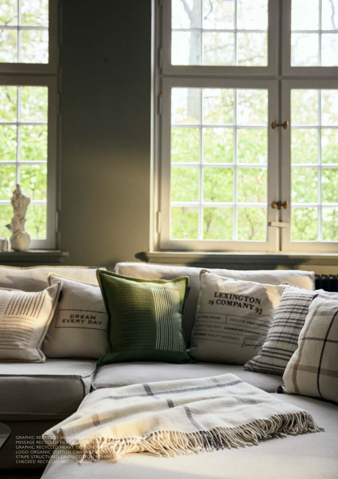
GRAPHIC RECYCLED HEAVY COTTON TWILL PILLOW COVER MESSAGE RECYCLED HEAVY COTTON TWILL PILLOW COVER GRAPHIC RECYCLED HEAVY COTTON TWILL PILLOW COVER LOGO ORGANIC COTTON CANVAS PILLOW COVER STRIPED STRUCTURED LINEN/COTTON PILLOW COVER CHECKED RECYCLED WOOL THROW