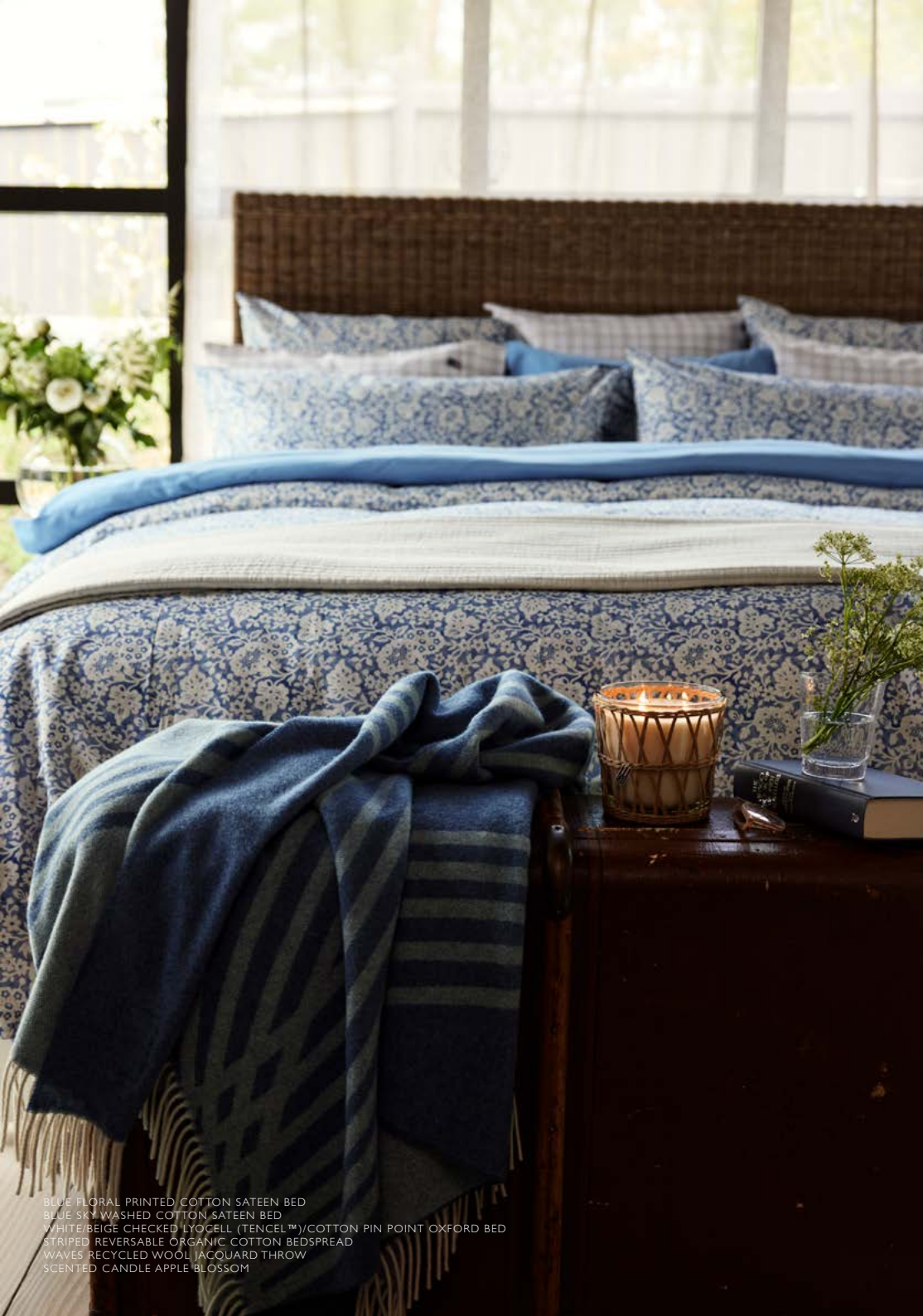
BLUE FLORAL PRINTED COTTON SATEEN BED BLUE SKY WASHED COTTON SATEEN BED WHITE/BEIGE CHECKED LYOCCELL (TENCEL™)/COTTON PIN POINT OXFORD BED STRIPED REVERSABLE ORGANIC COTTON BEDSPREAD WAVES RECYCLED WOOL JACQUARD THROW SCENTED CANDLE APPLE BLOSSOM