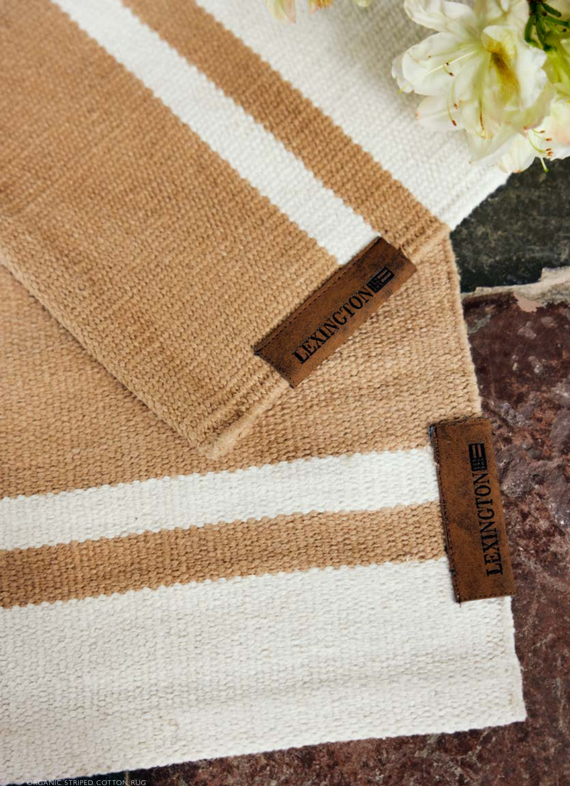
ORGANIC STRIPED COTTON RUG