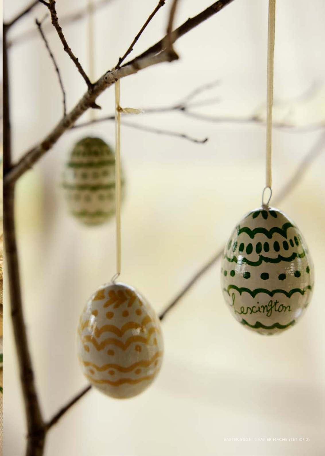
EASTER EGGS IN PAPIER MACHE (SET OF 2)