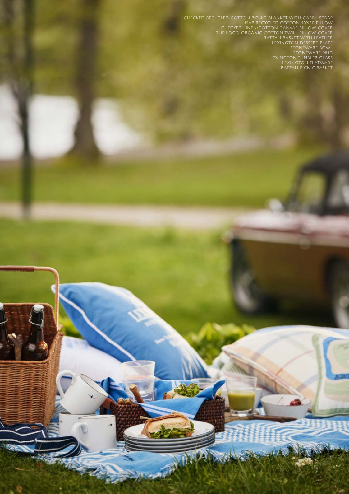
CHECKED RECYCLED COTTON PICNIC BLANKET WITH CARRY STRAP MAP RECYCLED COTTON 40X30 PILLOW CHECKED LINEN/COTTON CANVAS PILLOW COVER THE LOGO ORGANIC COTTON TWILL PILLOW COVER RATTAN BASKET WITH LEATHER LEXINGTON DESSERT PLATE STONEWARE BOWL STONEWARE MUG LEXINGTON TUMBLER GLASS LEXINGTON FLATWARE RATTAN PICNIC BASKET