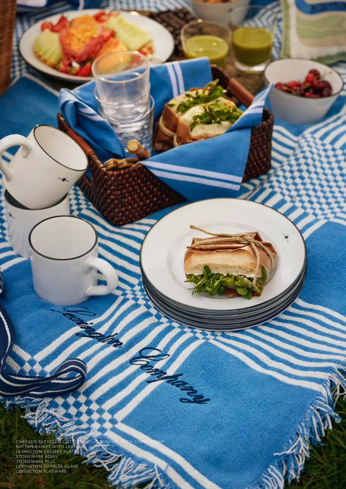
CHECKED RECYCLED COTTON PICNIC BLANKET WITH CARRY STRAP RATTAN BASKET WITH LEATHER LEXINGTON DESSERT PLATE STONEWARE BOWL STONEWARE MUG LEXINGTON TUMBLER GLASS LEXINGTON FLATWARE