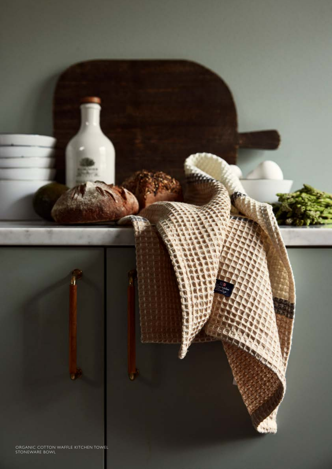
ORGANIC COTTON WAFFLE KITCHEN TOWEL STONEWARE BOWL