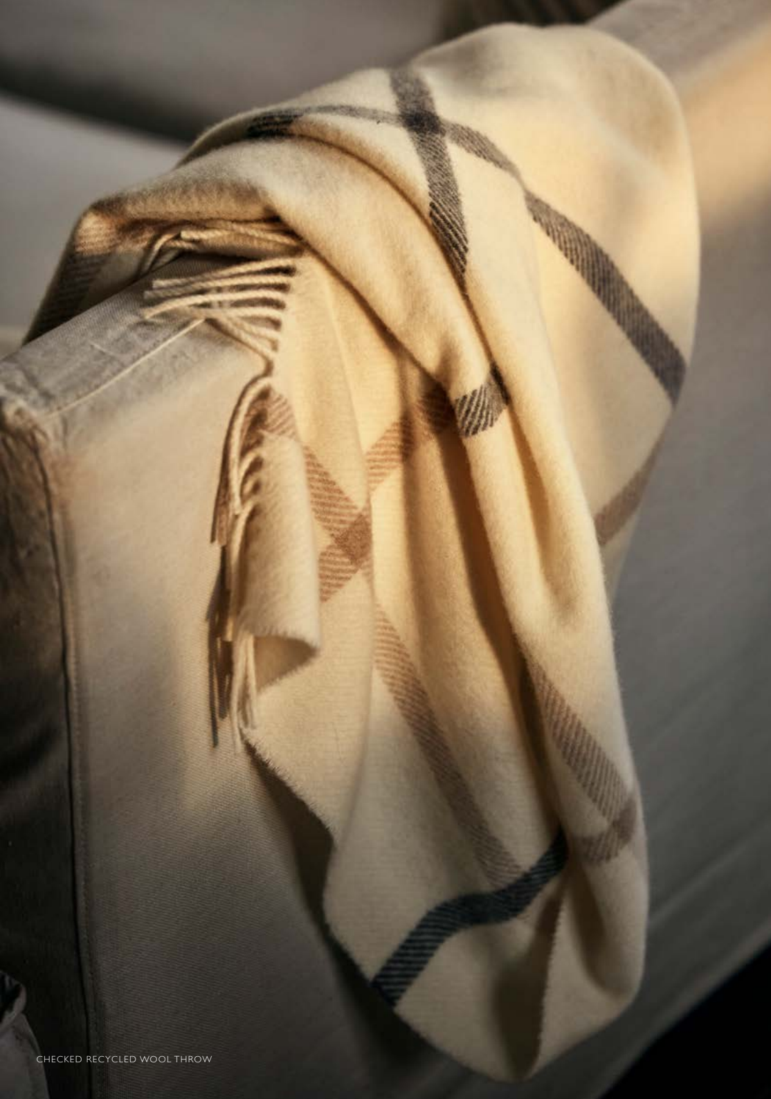
CHECKED RECYCLED WOOL THROW